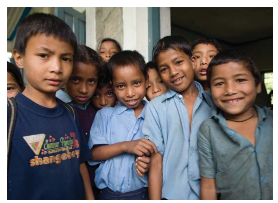
Nepalese children from a previously unelectrified village stand outside their schoolhouse, which now receives clean hydroelectric power from the community-based Lamjung Electricity Development Company, made possible by the US-based community investors E + Co.

principal is greater than putting your money into an insured bank account. However, CDLFs use grant money and loss reserves to help protect individual investors. Of the 508 community development financial institutions surveyed through the CDFI Data Project through 2007, none have reported that they have ever lost any investor principal.