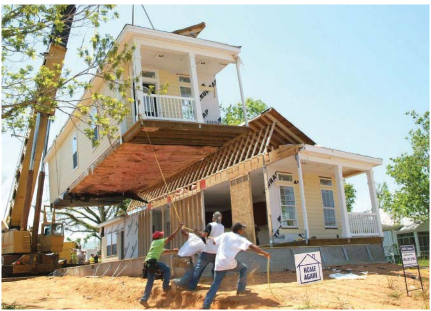
Local residents participate in a houseraising financed by ECD/Hope Community Credit Union in Mississippi after Hurricane Katrina. The local credit union was instrumental in helping storm victims recover from the disaster.

Unfortunately, with the collapse of the subprime lending market, communities like Peachtree Hills — with its higher concentration of lower-income households — got hit disproportionately hard. Exploding interest rates on abusive home loans