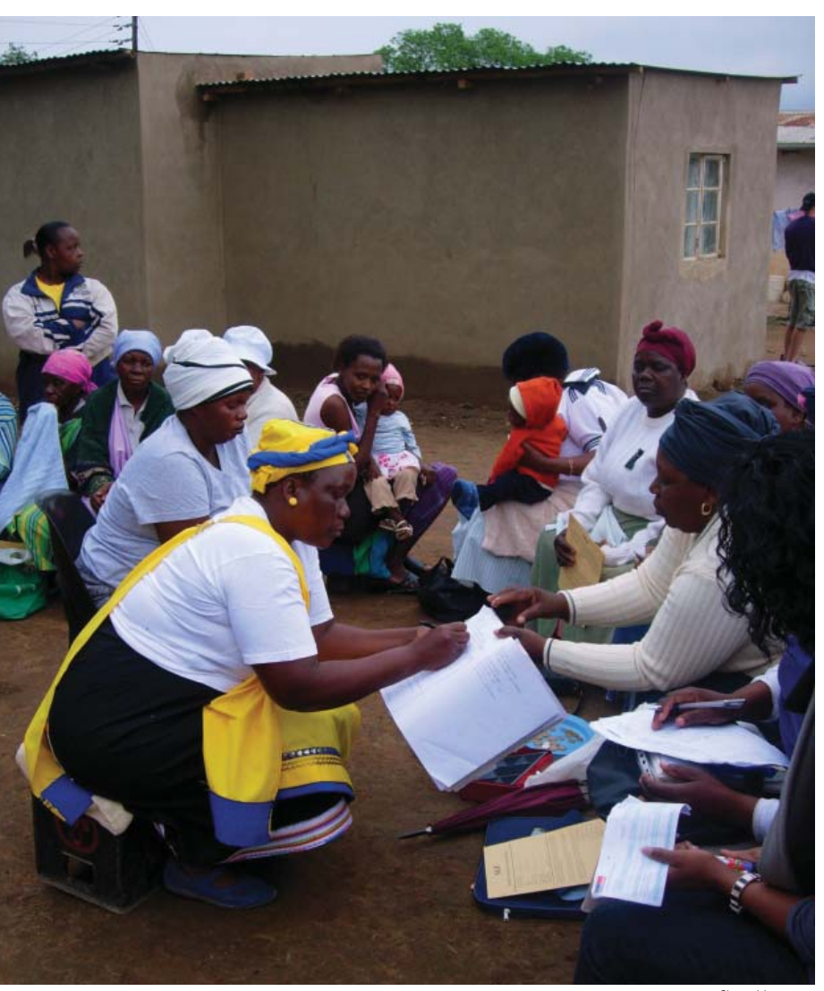
In Limpopo, South Africa, a client repays her loan from the Small Enterprise Foundation which is backed by the US-based micro-lender Shared Interest. These entrepreneurs use their micro-loans to launch and run small businesses vital to their local community.